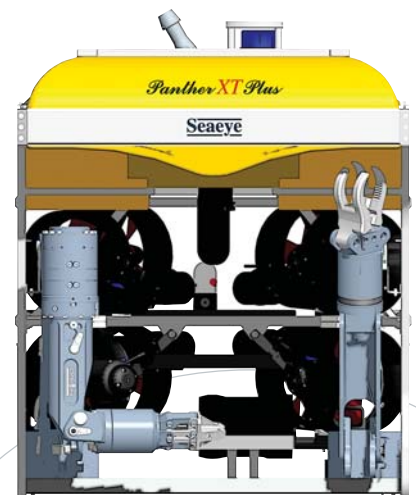
SAAB SEAEYE'S NEW HIGH PERFORMANCE, LIGHT WORK ROV